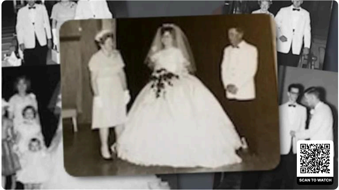
LeRoy's Slideshow Tribute